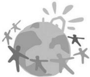
World Autism Awareness Day

Saturday 24 March 9.30am - 12.30pm at St Mark's Church.