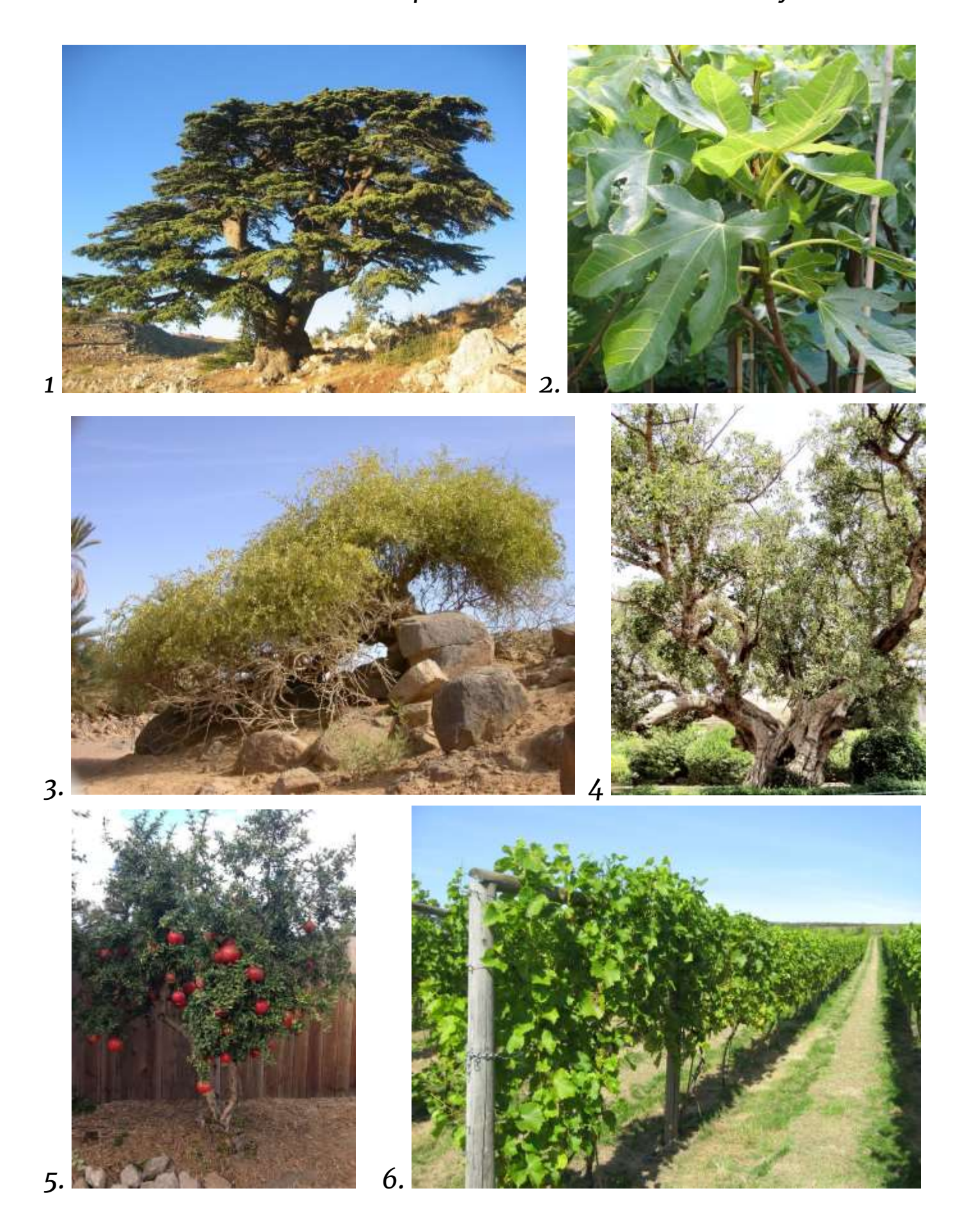
<u>Opening activity</u> Bible trees and plants quiz Guess these biblical trees and plants – answers at the end of the sheet